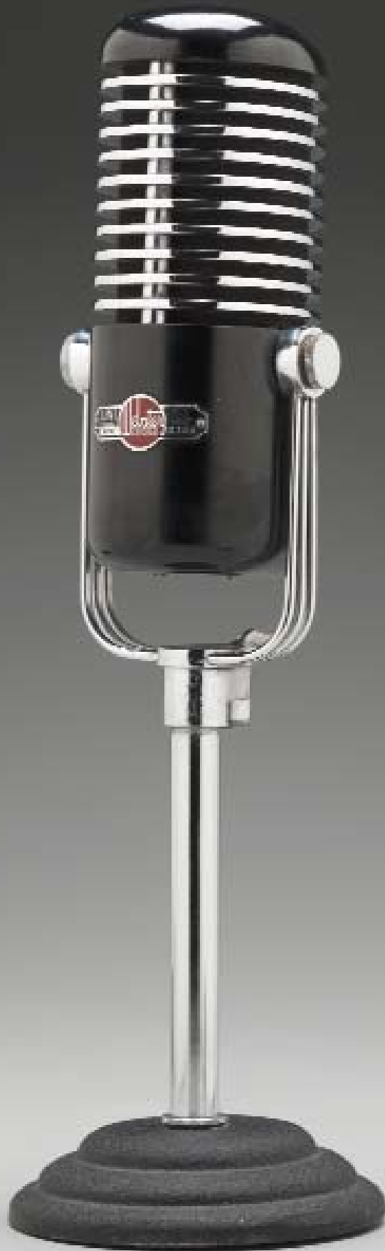
WEBSTER-CHICAGO CORPORATION, CHICAGO, ILLINOIS, MAKER Microphone (Model W-1248) c. 1936–1940 Bakelite with chrome-plated steel and various materials Discretionary Decorative Arts Fund and 20th-Century Design Fund, 2004.3