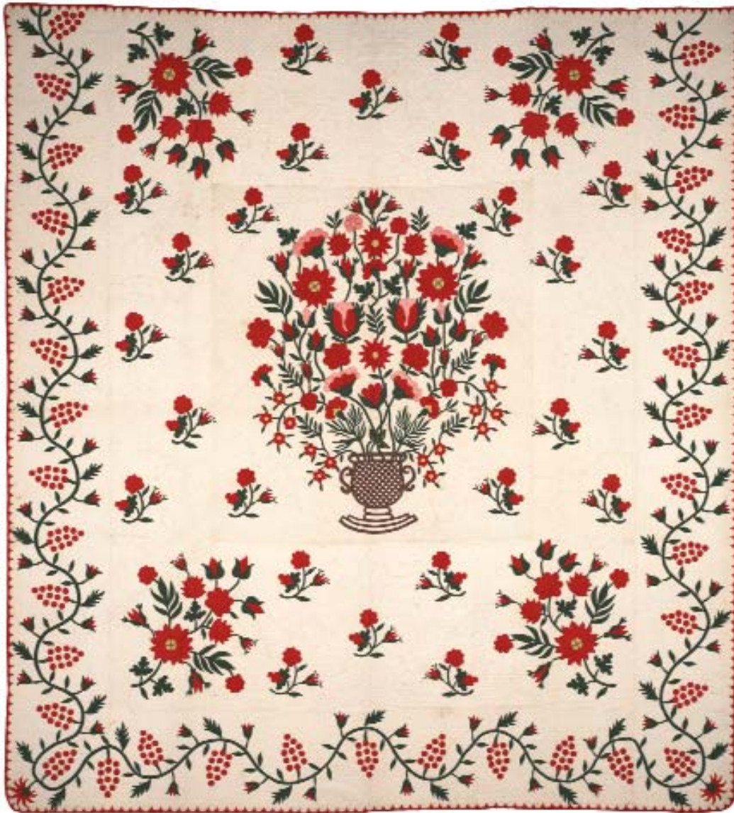
Top: PENNSYLVANIA Urn of Flowers quilt c. 1850 Appliquéd cotton Anonymous gift, 2004.12