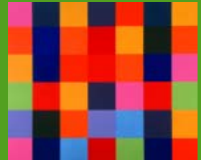
Above: Ellsworth Kelly, Sanary, 1952, oil on wood, Marguerite and Robert Hoffman Collection