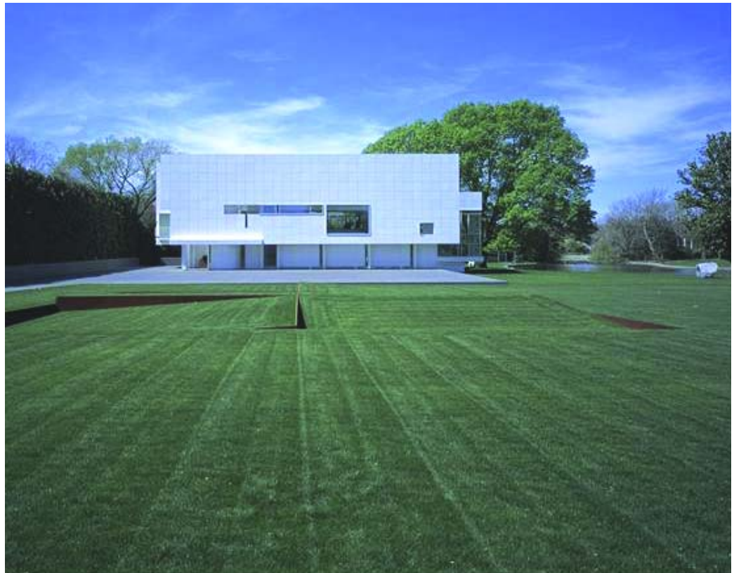
The Rachofsky House, Richard Meier & Partners, Architects LLP, 1991–1996.

This impressive level of success followed the inspired and dedicated leadership of the Centennial Campaign Co-Chairs, the Campaign's Executive Committee, and Museum trustees and staff. We extend heartfelt thanks for their commitment to the future of the Dallas Museum of Art.