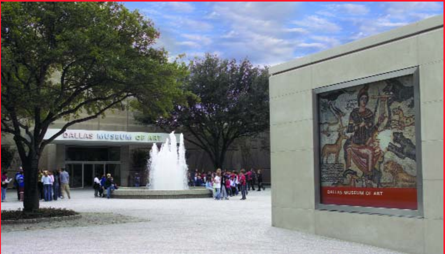
The recently revamped Flora Street Entrance.

The building master plan, funded by an anonymous donor in the Centennial Campaign, will identify resources to be raised during the ongoing Campaign for a reinstallation of the collections, a more intuitive pathway from gallery to gallery and floor to floor, and art storage necessary for the next decade of collections growth.